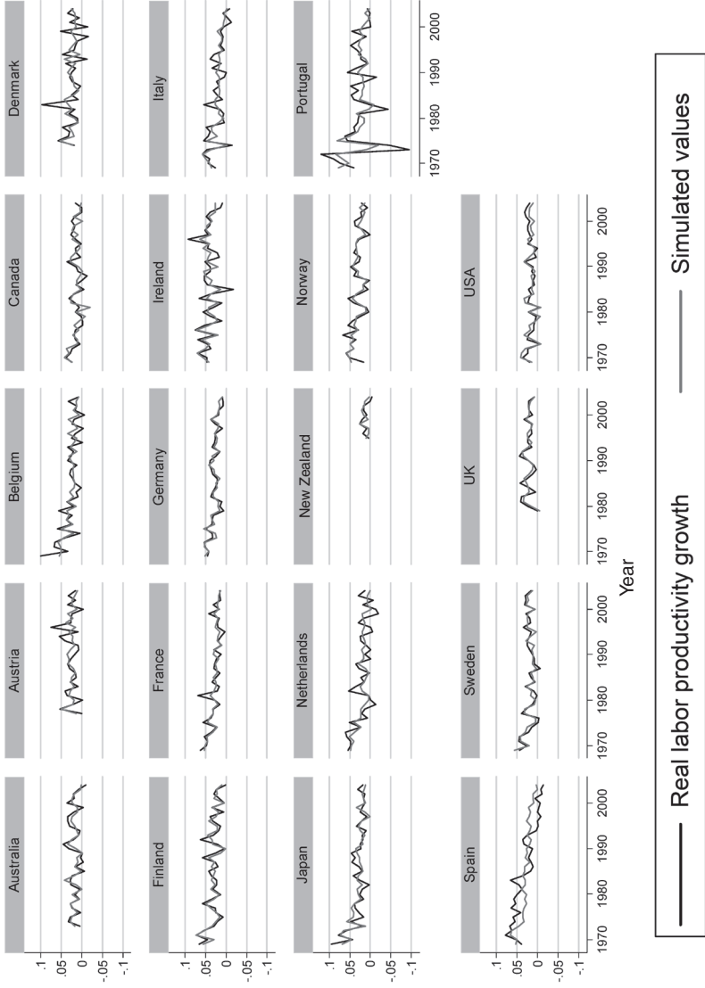
Figure 5 Comparison between observed and simulated labor productivity growth