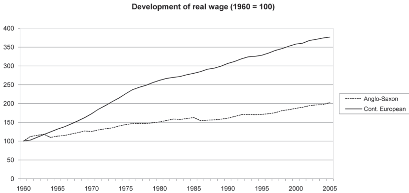
Figure 1 Development of real wages: Anglo-Saxon versus Continental European countries (1960–2005)