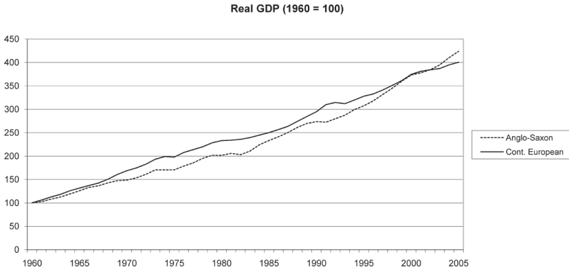
Figure 3 Development of real GDP: Anglo-Saxon versus Continental European countries (1960–2005)