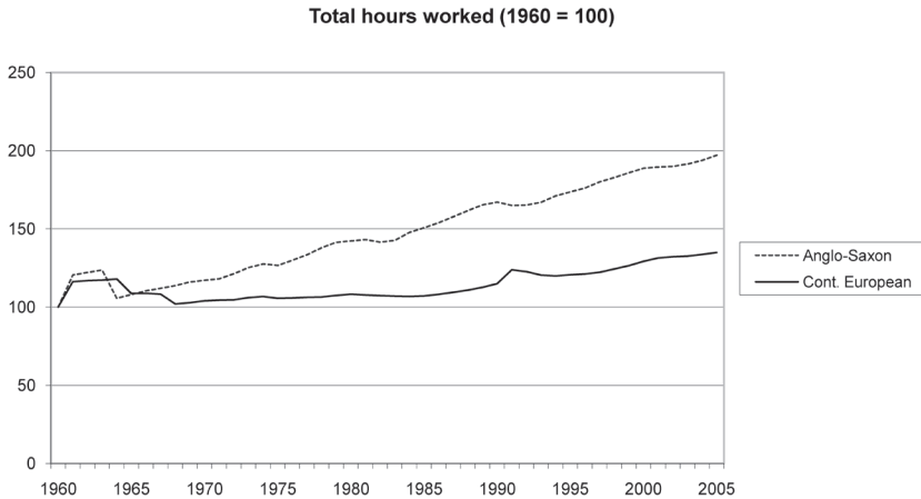
Figure 2 Development of total hours worked: Anglo-Saxon versus Continental European countries (1960–2005)